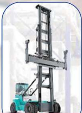
Empty CNTR Handler