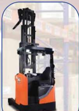
Electric Reach Truck